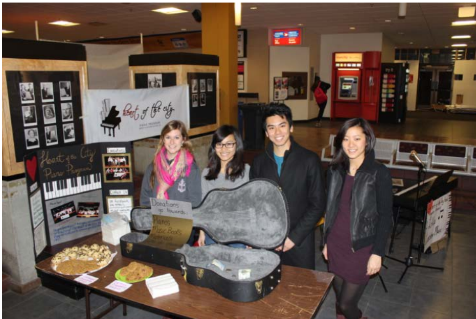
Some of the club executives pose at the Heart of the City's Fall Charity Concert hosted in the Student Union Building.