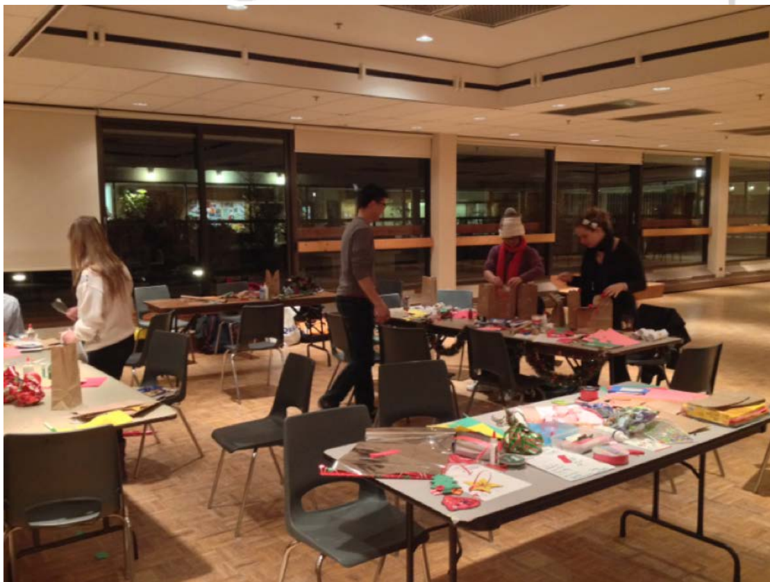
Volunteer teachers arrive at our Christmas Craft Fair where volunteers make Christmas ornaments for their students while snacking on hot chocolate and cookies.

To finish off the term, we held an HCPP Charity Concert where advanced pianists from both within and outside our club performed musical acts for donations. Several executives also brought home baked goods to sell at this event. The concert proved to be successful as we raised significant funds towards our club, as well as promoted ourselves to the student body. Overall this term has been a highly successful term for our branch and we look forward to another year of HCPP in 2014.